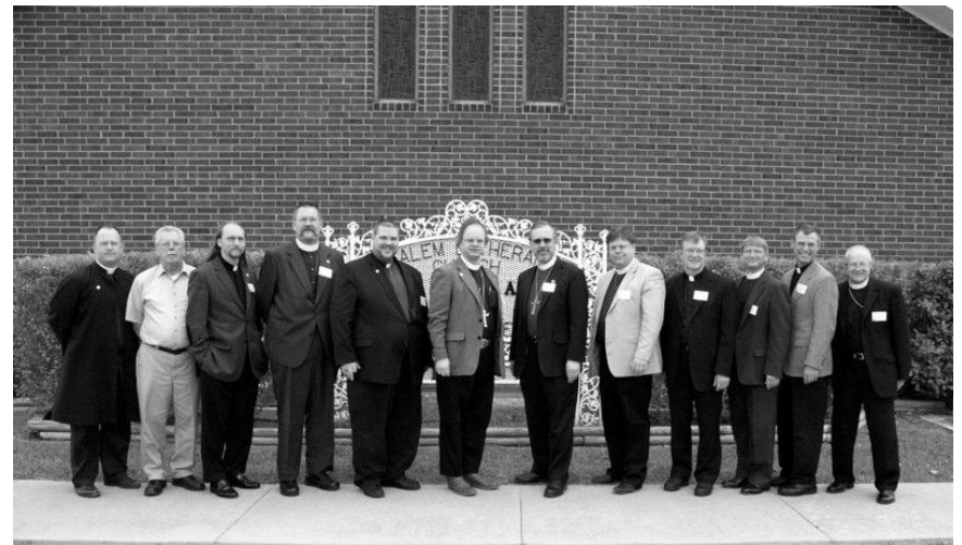
Pastors of the Evangelical Lutheran Diocese of North America attending their annual conference.